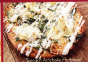
Spinach Artichoke Flatbread